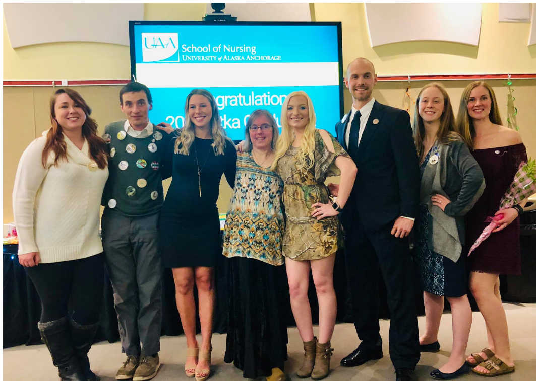
SITKA CAMPUS NURSING GRADUATION