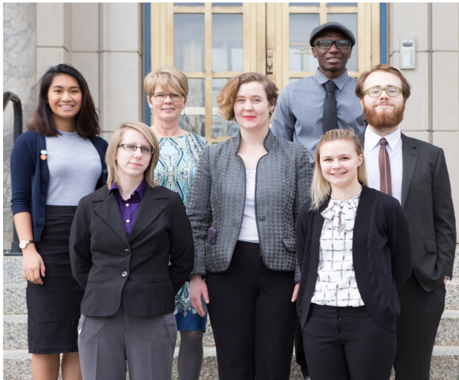
Senator Ted Stevens Legislative Interns 2018

Developing Alaska's most precious resource: Its people